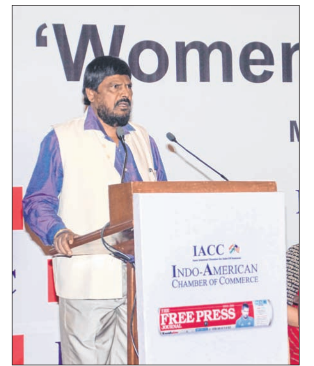
Union Minister for Social Justice & Empowerment Ramdas Athawale delivering the keynote address.

At the panel 'Women empowerment and social transformation- Justice Weaker sections', Ananda said, "Discrimination starts the way we are brought up." There is discrimination at all levels, she stressed, but she felt that sexual abuse against